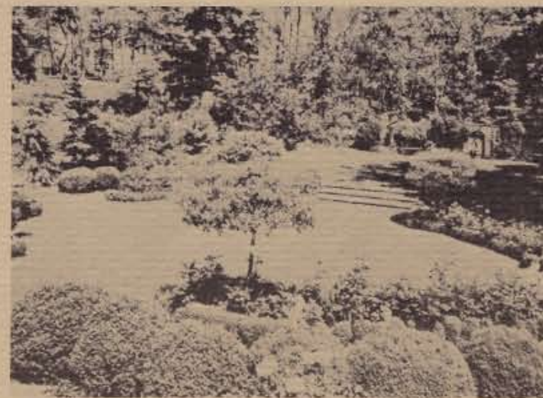
A FEW EXAMPLES OF GARDENS - in the Washington Metropolitan Area