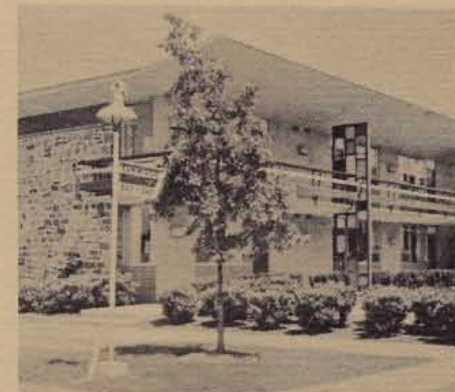
Marriott Motor Hotel