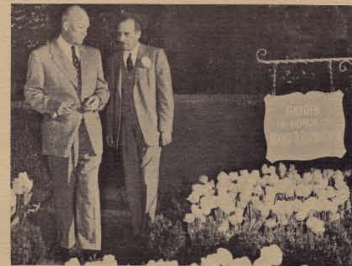
NATIONAL CAPITOL FLOWER & GARDEN SHOW - An important event in the nation's capital for the past twenty years.