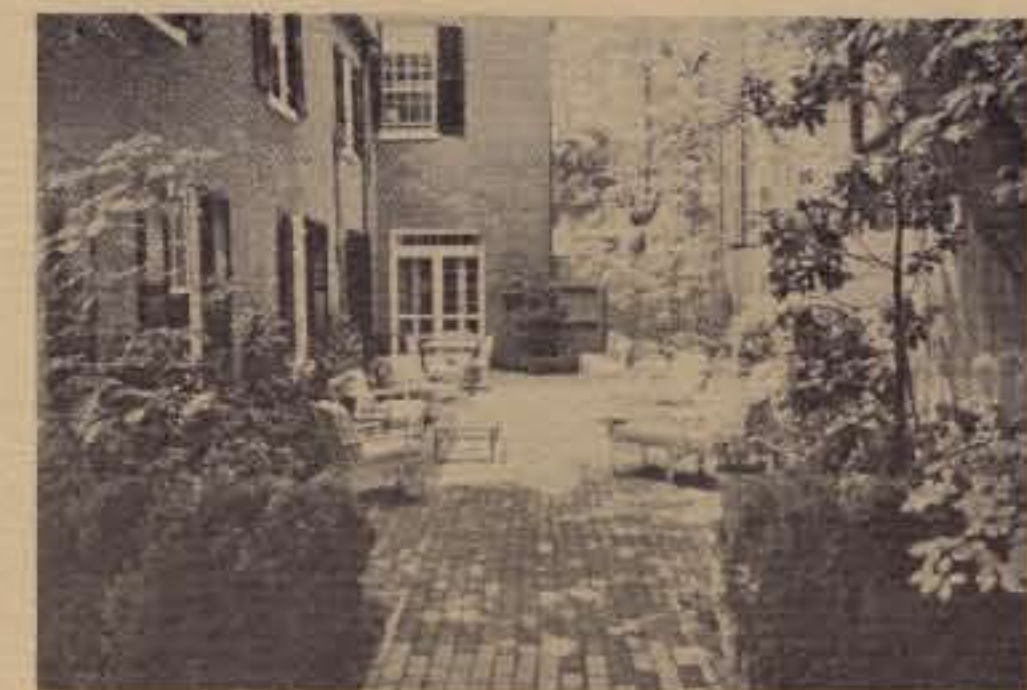
An Example of Georgetown Garden