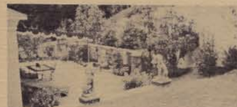
Washington Metropolitan Area Garden