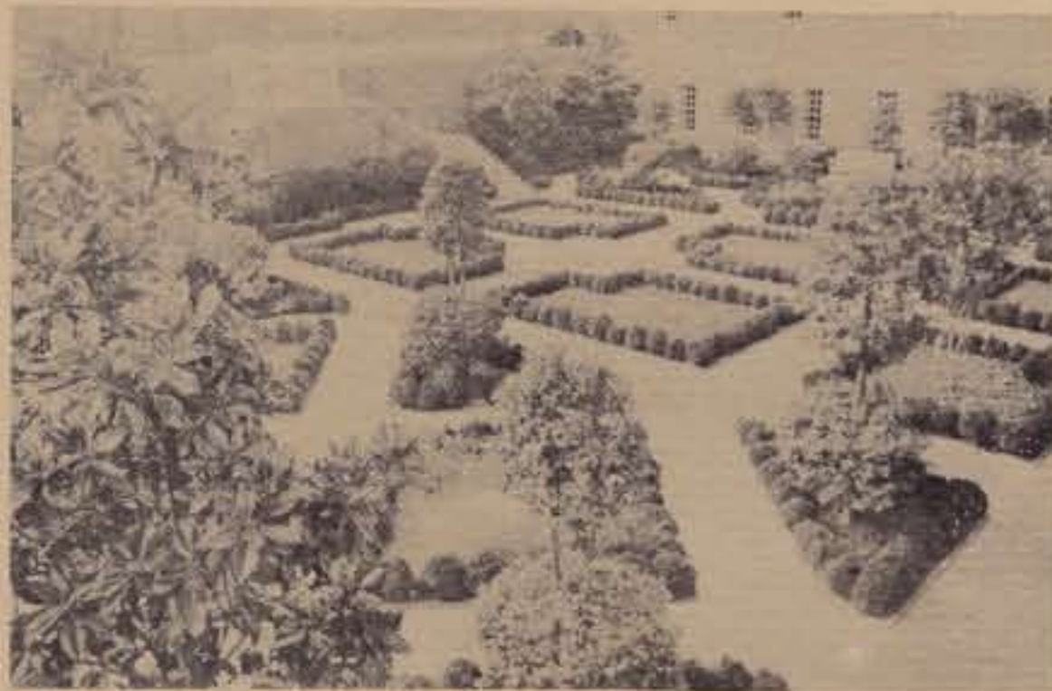
Equitable Life Insurance Co. - Formal Garden