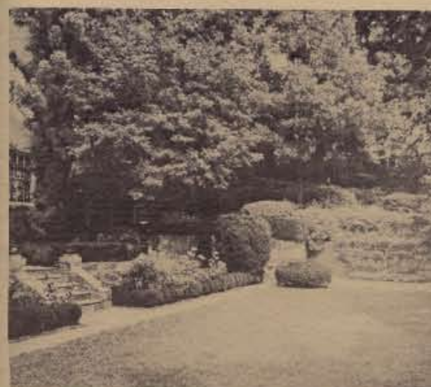
Washington Metropolitan Area Garden